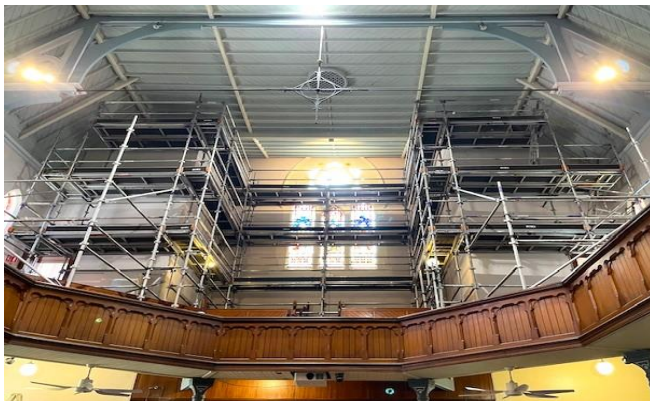
Scaffolding – Leigh Memorial northern end.