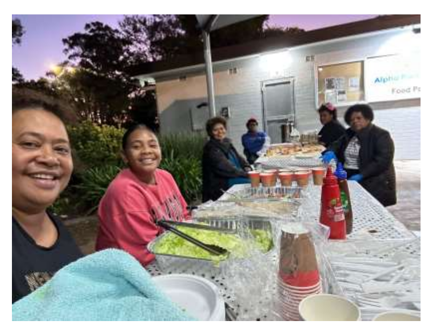
Bula Feeding on Monday (22 April).