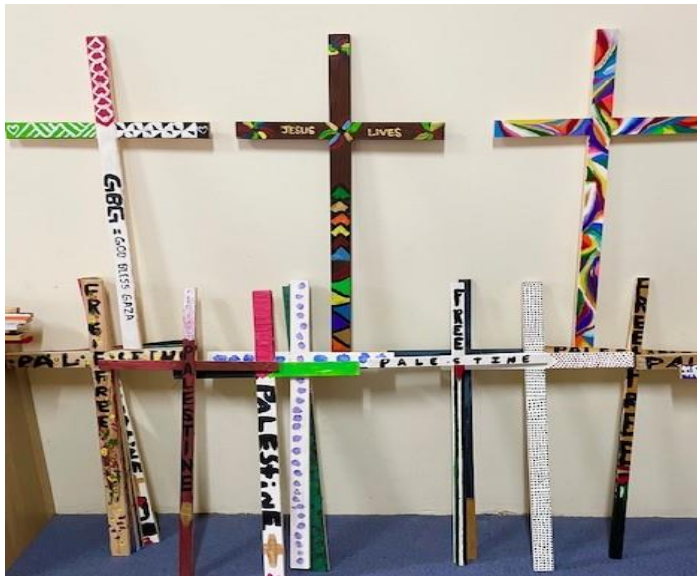
Painted Crosses (decorated by the Leigh Fijian Youth) – will be carried at the Gaza Ceasefire Pilgrimage Walk this Saturday.