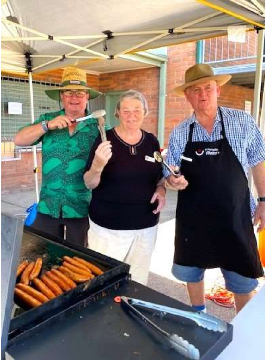
PCUC BBQ: Northmead Uniting Netball Club 'Season Kick-starter'