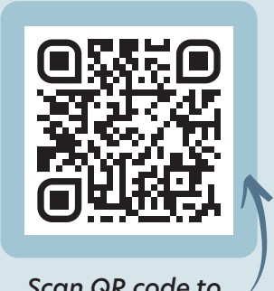
Scan QR code to watch the full story

In the Central Tablelands of NSW, Orange was once home to three separate Uniting Church congregations, each with unique mission and outreach priorities. Now, coming together as a united, strengthened, renewed congregation; Orange Uniting is thriving with innovative missional outreaches, a fresh expression of church, and a growing community to walk alongside - but change brings hardship and sacrifice.