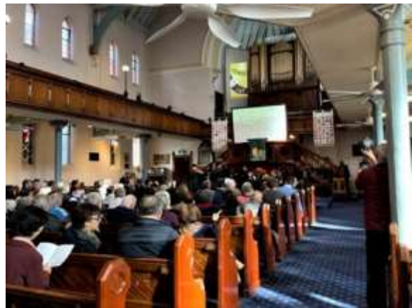
Leigh Memorial: August-September 2023