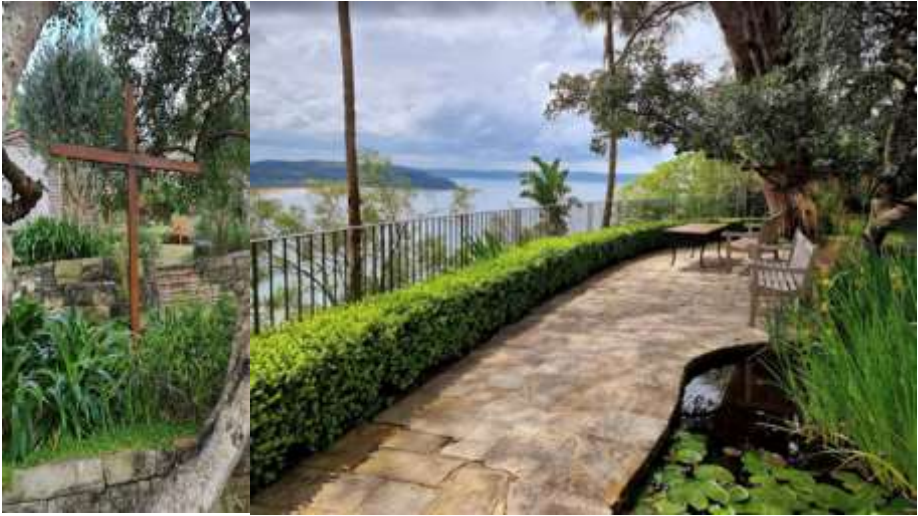
The beautiful Bible Garden, Palm Beach

If you enjoyed the 1 st bus trip post Covid to Palm Beach, then lets plan another outing on 30 th August – destination to be decided.