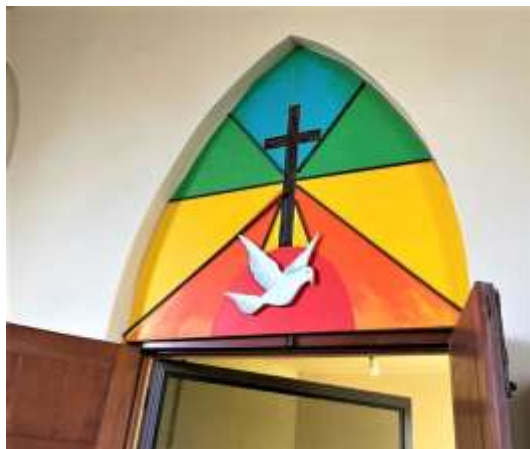
Historic Castlereagh Uniting Church (interior doorway decoration)