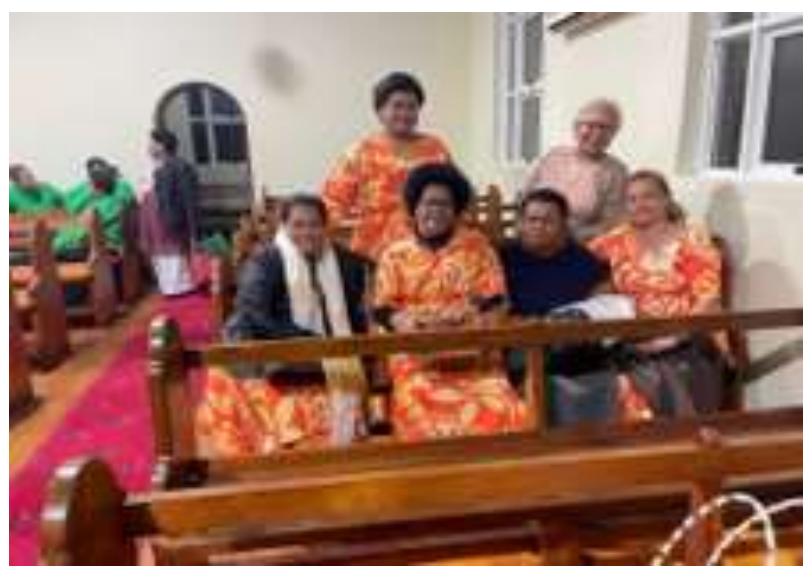
Parramatta Leigh Fijian women's group attending the Sydney Fijian women's Uniting Church rally at Berala Uniting Church last Saturday the 17<sup>th</sup> of June.