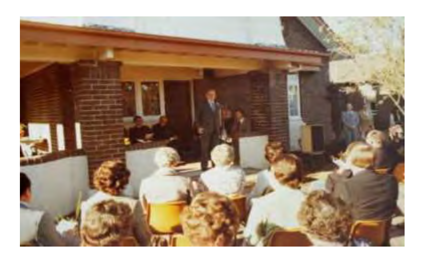
– The first official Worship Service at Queen's Road, Westmead. (The early services were held in the café space).