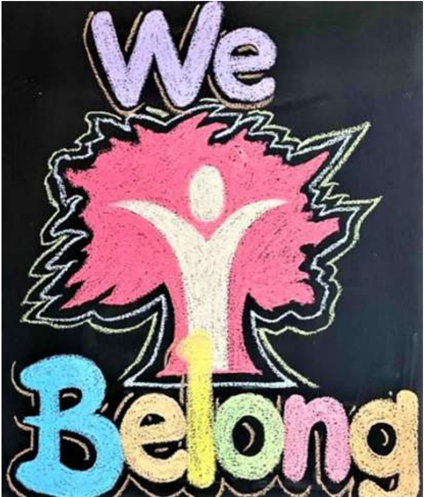
Chalk Art – Meals Plus