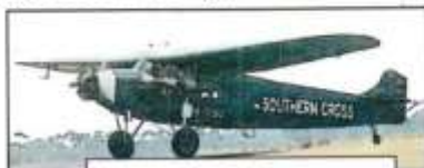
Replica of the Southern Cross

Free entry, afternoon tea gold coin donation.