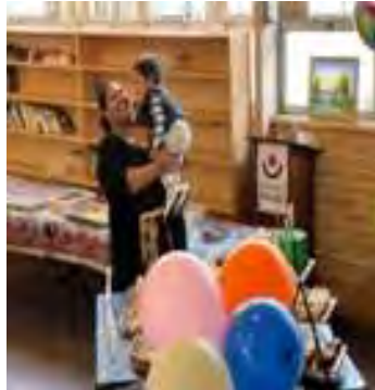
Bula Feeding servicing the homeless on (09 May 2023)