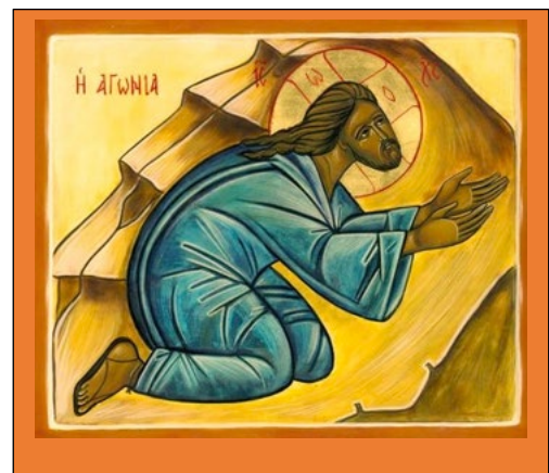
Image of all divine power and life, yet with feet touching our earth and hands held out towards us, our inspiration and our friend, Jesus Christ: