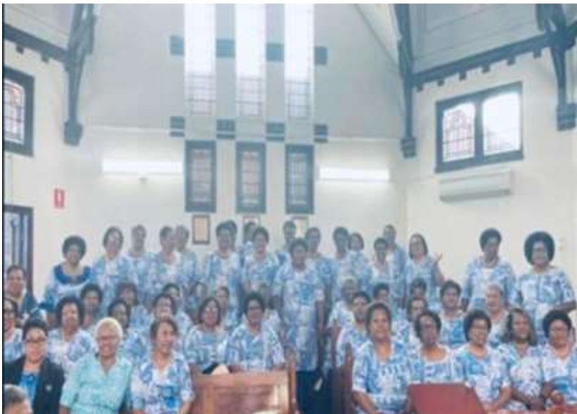
Sydney Uniting Fijian Fellowship 2023