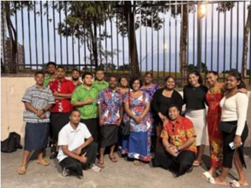
Leigh Fijian and Berala Fijian Youth 2023