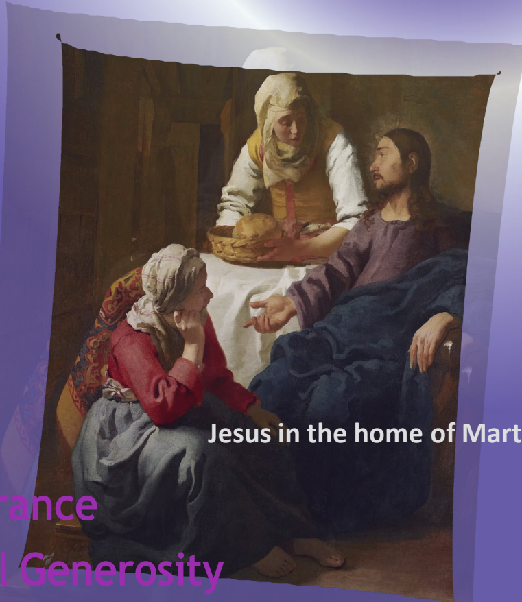
Jesus in the home of Martha & Mary