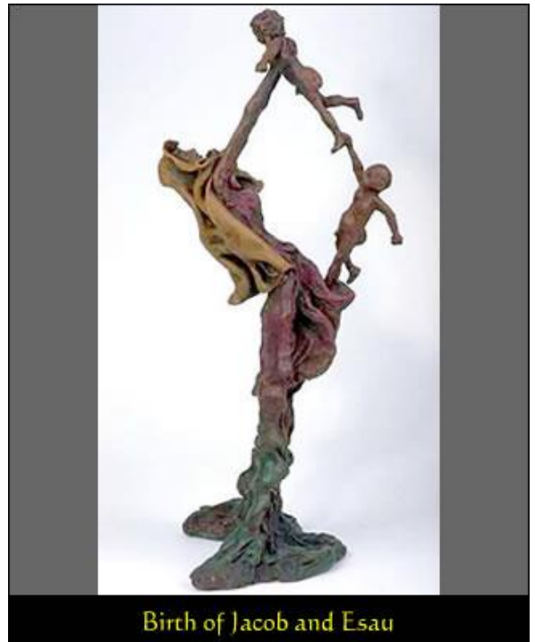
Birth of Jacob and Esau

out, with his hand gripping Esau's heel; so he was named Jacob. Isaac was sixty years old when she bore them. When the boys grew up, Esau was a skillful hunter, a man of the field, while Jacob was a quiet man, living in tents. Isaac loved Esau, because he was fond of game; but Rebekah loved Jacob. Once when Jacob was cooking a stew, Esau came in from the field, and he was famished. Esau said to Jacob, "Let me eat some of that red stuff, for I am famished!" (Therefore he was called Edom.) Jacob said, "First sell me your birthright." Esau said, "I am about to die; of what use is a birthright to me?" Jacob said, "Swear to me first." So he swore to him, and sold his birthright to Jacob. Then Jacob gave Esau bread and lentil stew, and he ate and drank, and rose and went his way. Thus Esau despised his birthright.