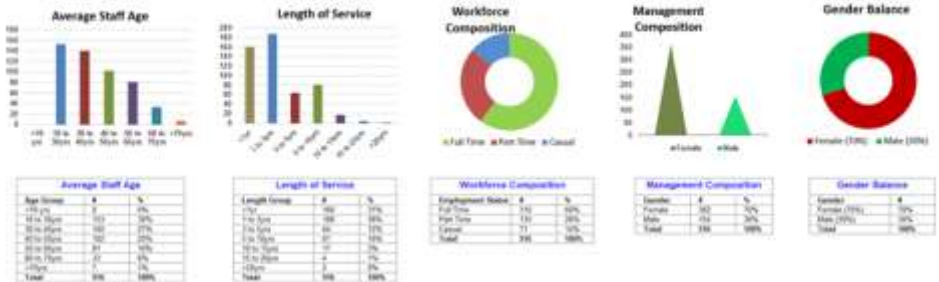
Key Performance Indicators Selected period from 01/01/2018 to 31/03/2020 As at 30/03/2020 11:27