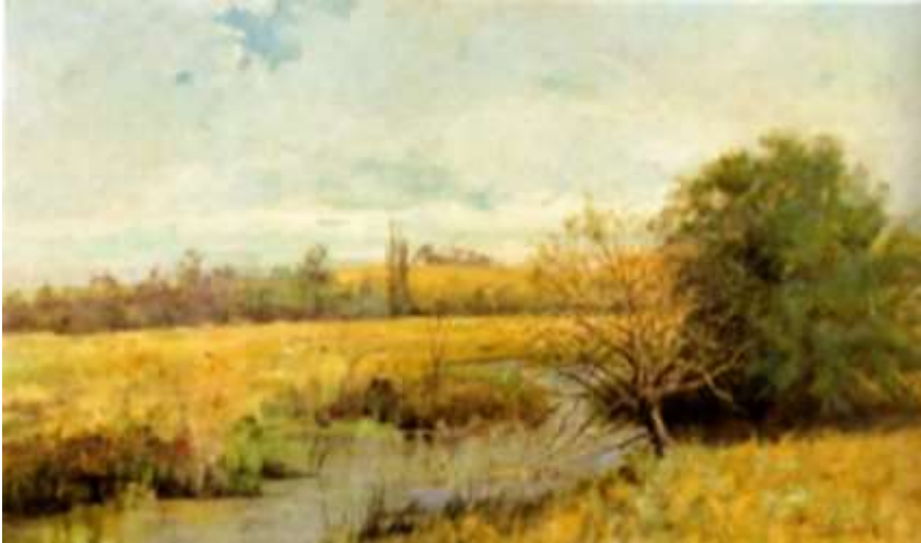
Painting 3: Jane Sutherland – First Green after the Drought (Australia, 1892).

Prayer point: Farmers battling the drought.