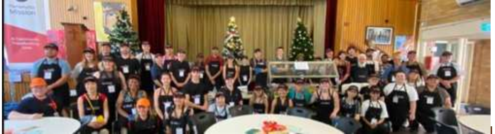
BELOW Christmas Day At Parramatta Mission