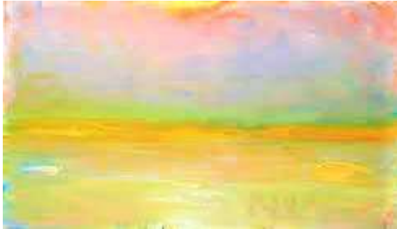
Painting 1: Lloyd Rees – Fire haze at Gerringong (1980).

During January last year, our 'Summer Series' focussed on Nativity paintings from around the world. This year, our series will utilise Australian artworks, dating from 1889 – 2019 – and provide accompanying prayer points for those impacted by bushfires, drought, rural issues and reconciliation .