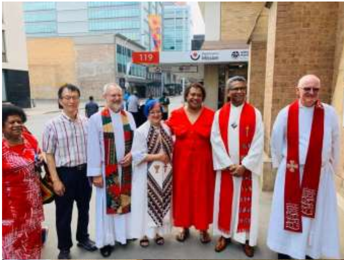
LEFT The greeting line after the Christmas Day service at Leigh Memorial church.