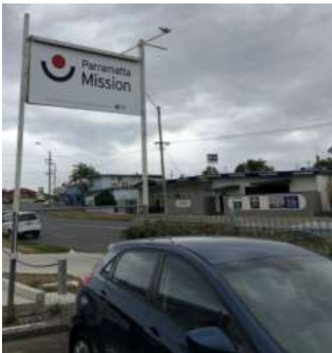
LEFT: Our office in Taree is about 2km away from the Taree Uniting Church. Here is our sign on the Oxley Street.