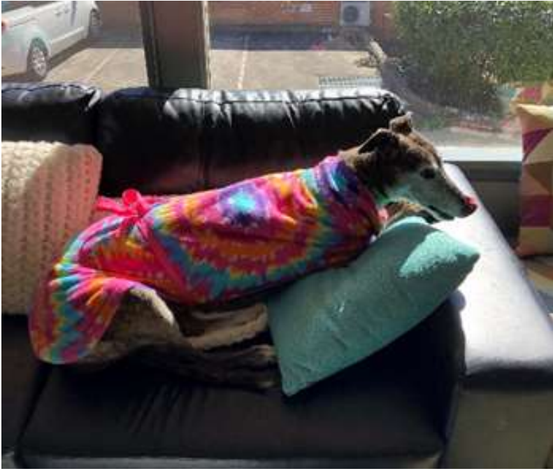
ABOVE: Shiloh with her winter coat.