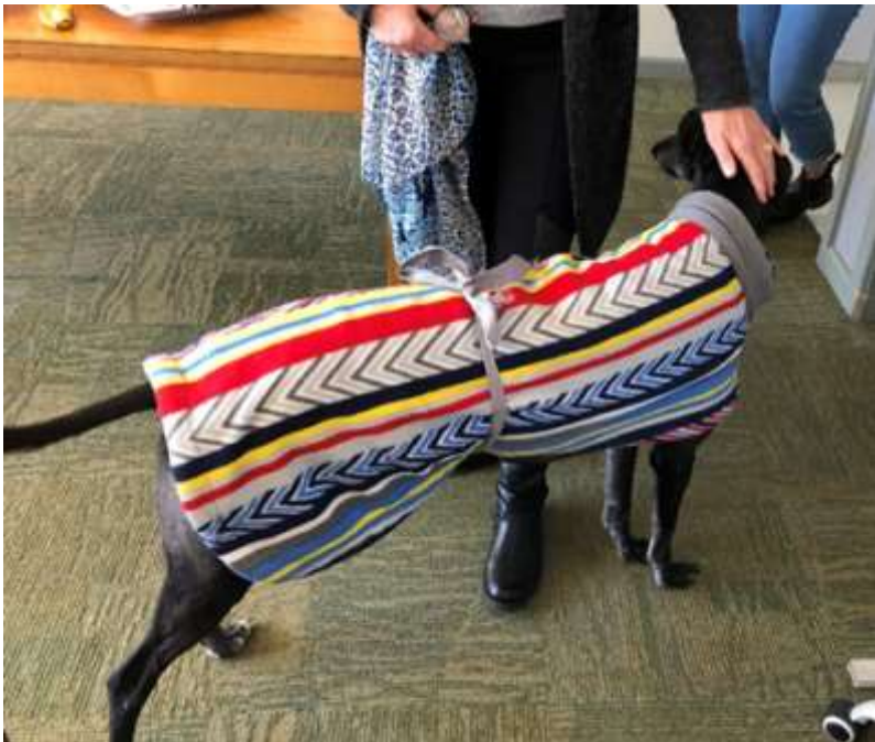
ABOVE: Diggs with his winter coat. Shiloh and Diggs also live at HASI Plus.