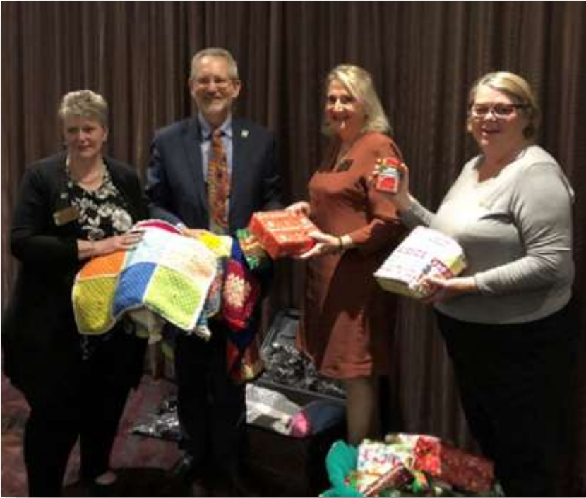
ABOVE: Parramatta Central Rotary collected a car full (almost literally!) of blankets and non-perishable food and fittingly enough presented them to PM during Homeless Week.