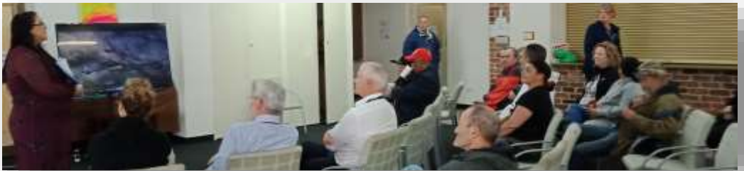
ABOVE: Attendees at the Half a Million Steps Tuesday 6th August

The past week has been homeless week. If only it was resolved in one week! Across Australia churches like ours and organisations and groups have been raising awareness, and seeking solutions. Homelessness is not having an address. That might mean sleeping on someone's couch, moving from place to place to place. It could also be staying in crisis accommodation, or rough sleeping. It is easy to blame the victim, and sometimes people could have made other choices. Sometimes people are getting out of domestic violence, sometimes it is loss of job, and therefore loss of flat or unit or house. Not many chose homelessness as a lifestyle choice.