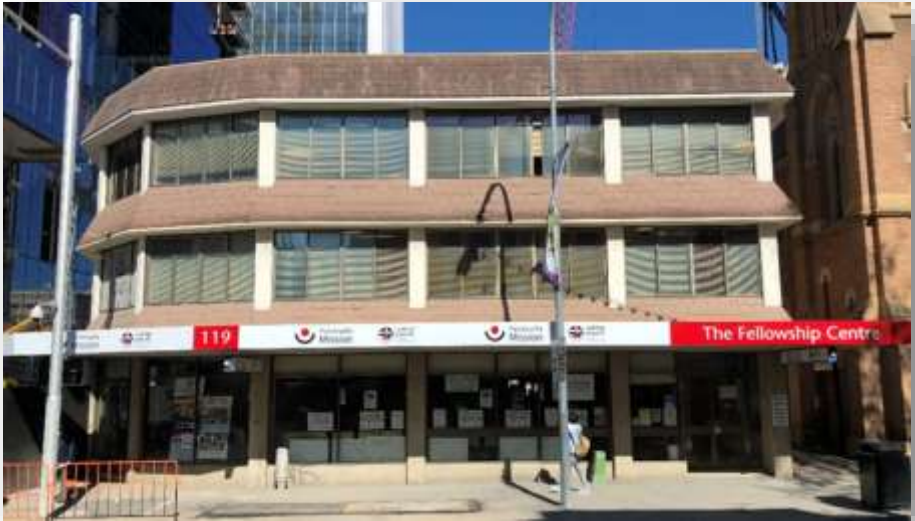
ABOVE: Can you see the street number 119, and the name The Fellowship Centre, The additions to the signs on our building in Parramatta.