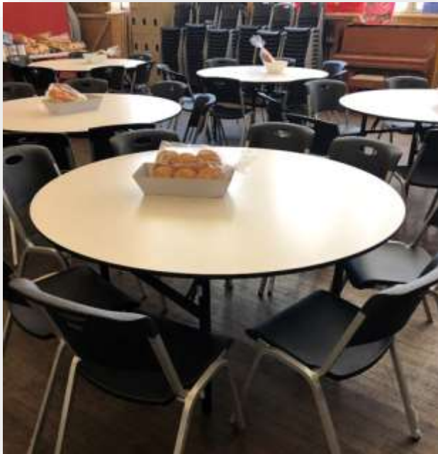
ABOVE: A new set of round tables and chairs for Meals Plus.