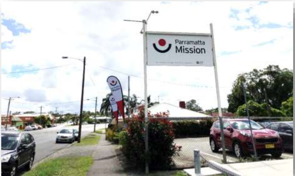
The New Parramatta Mission signs in Taree really stand out.

It is still not too late to join the Lenten devotions using the resource by Walter Brueggemann, A Way Other Than Our Own . I have copies available. Also, don't forget the weekly discussion, Monday 2-3 at Westmead, and Wednesday 6-7 at Alan Walker College.