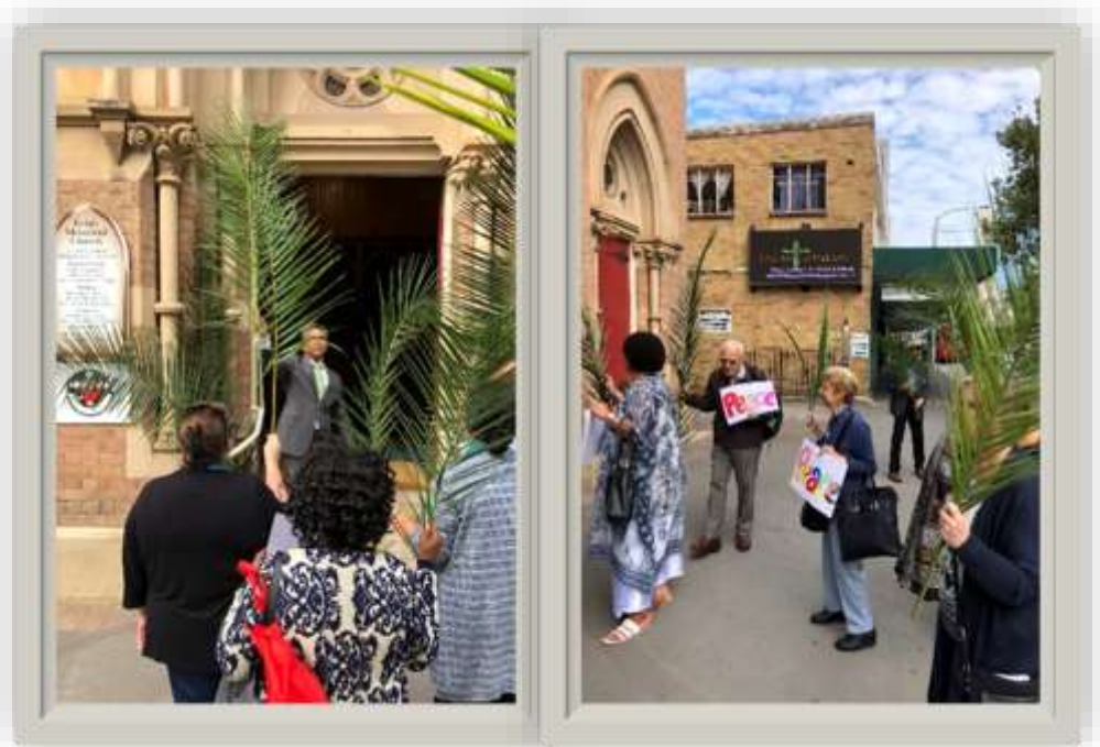
There were two Palm Sunday walks last Sunday in Parramatta. One for with the 9:30 congregation, above, and the other with the 11:15 am congregation, below.