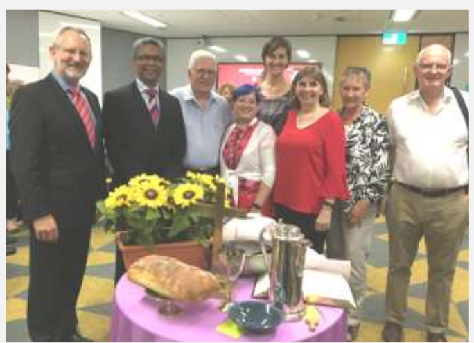
The PM pastoral team

Next week I will have news of my visit to common ground adelaide and to The Spire Community.