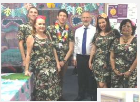
Many of the 121 WSLARS members enjoyed the tropical theme at Café Leisure.