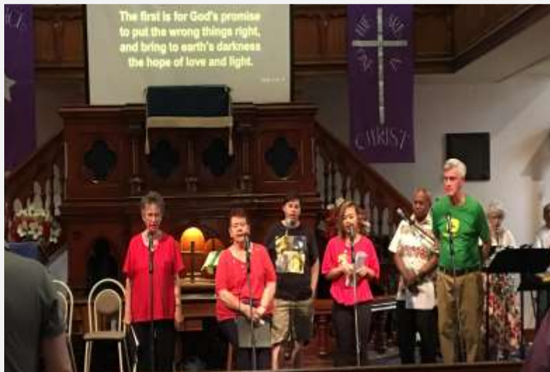
The Leigh Memorial Congregation Music Team leading the Christmas Carol singing last Sunday.