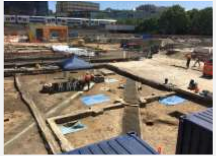
Archaeological dig in Parramatta Square, behind the Fellowship Centre 119 Macquarie St In the foreground and middle ground you can make out the old stream, originally convict built.