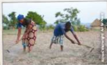
Newton, Zimbabwe, Act for Peace

Beauty and her husband toil long hours under the boiling sun to no avail.