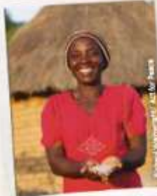
Beauty, Zimbabwe, Act for Peace