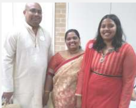
Pictures of Melbourne Cup day at the Westmead Fellowship, and the multicultural service last week