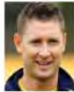
with Guest speaker Michael Clarke Captain of the Australian Cricket Team

Friday 27th June 2014 Commences at 7:00pm